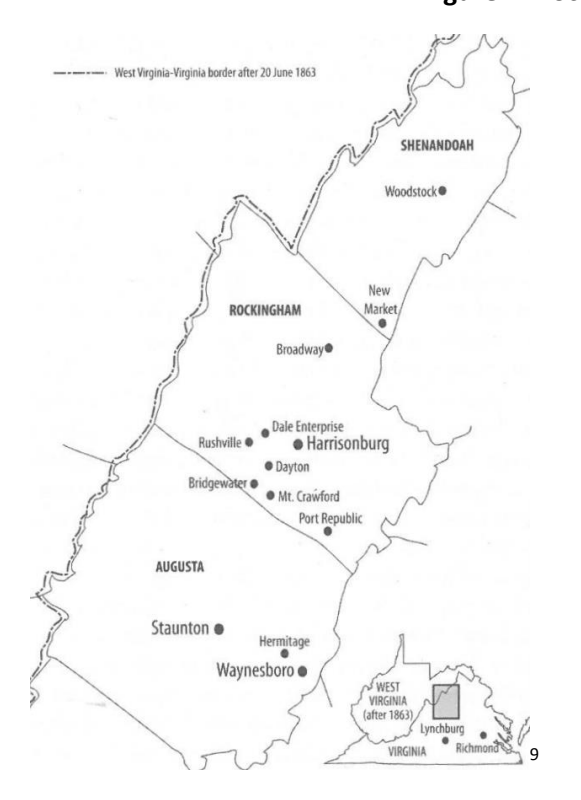
Figure 1: Rockingham County, Virginia

After 1710, a stream of Mennonites began to migrate to America. The chief location of migration was to Pennsylvania where Mennonites felt secure going to a place that was sympathetic toward them and guaranteed religious freedom. Soon after arriving in America, many Mennonites would make their way to Virginia. They settled largely in the Shenandoah Valley which now borders West Virginia. During the Revolutionary War, many Germans resettled farther down the Shenandoah Valley in Rockingham County which would become the heart of the Mennonite Church. Soon after the Revolutionary War, more Mennonites came from Pennsylvania and settled in Augusta County near the town of Waynesboro. (Figure 1)